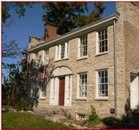
Hull Family Home and Farmstead Peace Garden in Lancaster, New York.