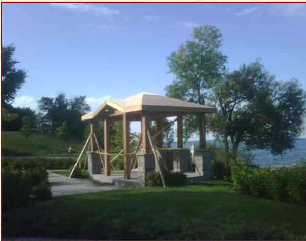
Grimsby Peace Garden in Grimsby, Ontario The Phelp Gazebo under construction.

What we never expected to happen however, was the sharing of the concept well beyond our local area thanks to the connectivity of the many Bicentennial regional groups that had begun forming and communicating in 2009 and 2010.