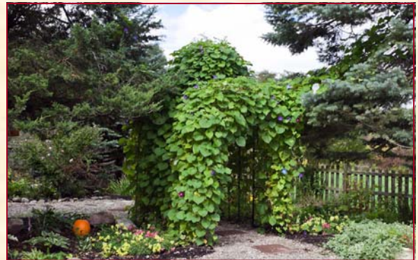
Trellised walkway at the Hull Family Home and Farmstead Peace Garden in Lancaster, New York.

In brainstorming the options that existed to make this happen, the concept of a garden with cultural space for community and visitor interaction, and the linking of these gardens through a trails network, was born. Because of our binational mandate and experience with the Binational Doors Open Niagara project since 2002, the Binational Tourism Alliance was asked by the Arts Council leaders to take on the project leadership for this initiative. We presented the concept to a variety of stakeholder groups on both sides of the border throughout 2008 and 2009, and by summer of 2009, had commitments for more than 20 gardens in the Binational Niagara Region.