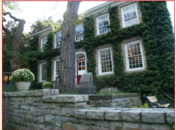
Mackenzie Printery in Niagara-on-the-Lake, Ontario – one of our Doors Open Niagara sites.

Much has taken place over the past four years to get us to this point and we continue to grow our partnerships throughout Ontario, New York, Michigan, Ohio and other states touching the Great Lakes. Based upon the preliminary plans now underway, we will be launching 60 gardens – 30 in each of the U.S. and Canada – as part of our Peace Garden Trail between May and October, 2012, with plans to add to this incrementally each year thereafter, and well beyond 2014 thanks to the number of historic events and anniversaries we have to celebrate over the coming years. The broad range of gardens are truly amazing – everything from traditional flower gardens, to