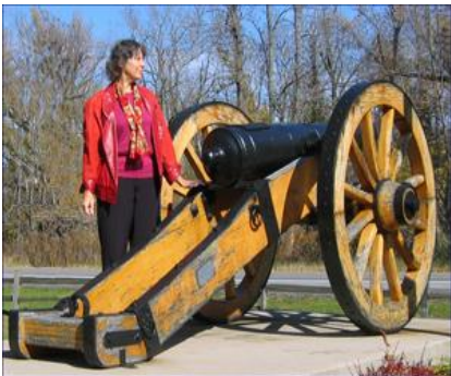
1812 Cheektowaga Cemetery