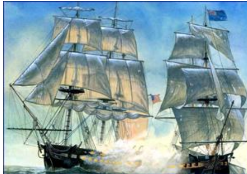
Struggles on the Lakes